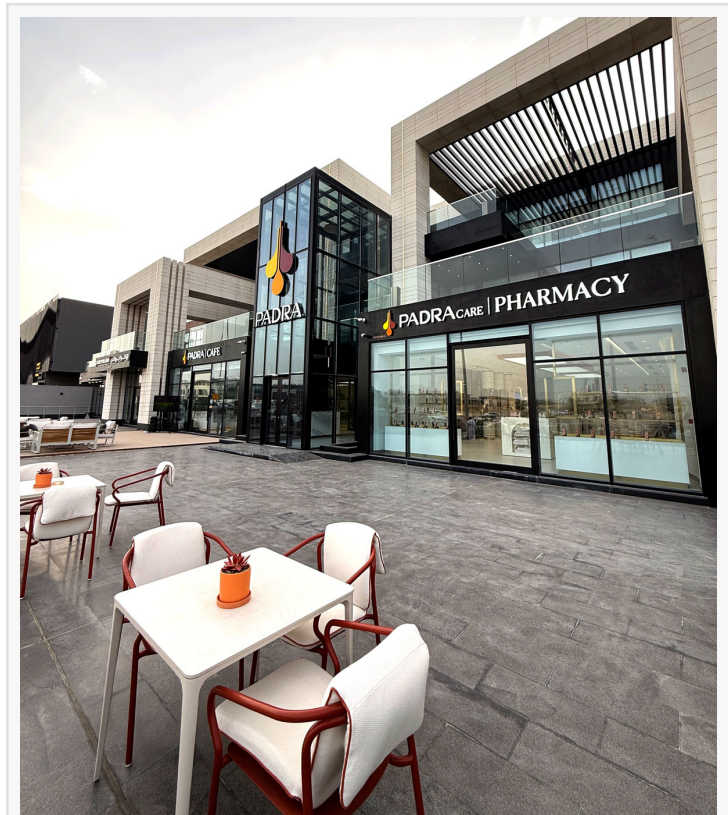
Padra's Saudi Arabia branch reflects the growing demand for discreet, premium hair restoration across the GCC.

A patient may want a stronger hairline, fuller density, or better facial balance, but they may not