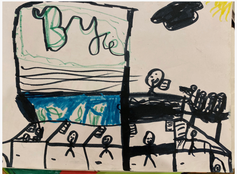
He depicted his future as a child and now he is manifesting his dream.