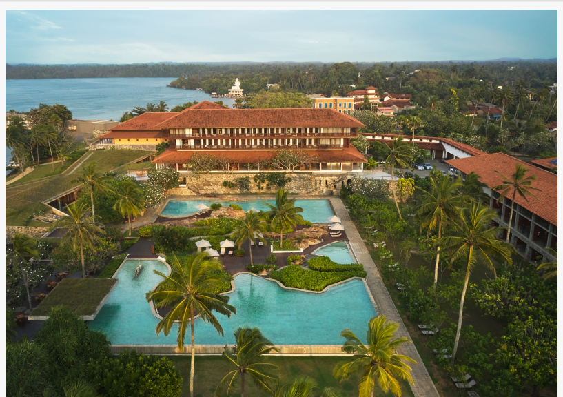
Cinnamon Bentota Beach - Signature Selection

Through Cinnamon DISCOVERY Island Rewards, each of the nine resorts pairs its doubled D$ earning with a mobile-exclusive booking bonus. Members booking via mobile receive complimentary Sundown cocktails for two at Cinnamon Bey Beruwala, Cinnamon Citadel Kandy, Cinnamon Wild Yala, Cinnamon Lodge Habarana, Habarana Village by Cinnamon, Hikka Tranz by Cinnamon and Kandy Myst by