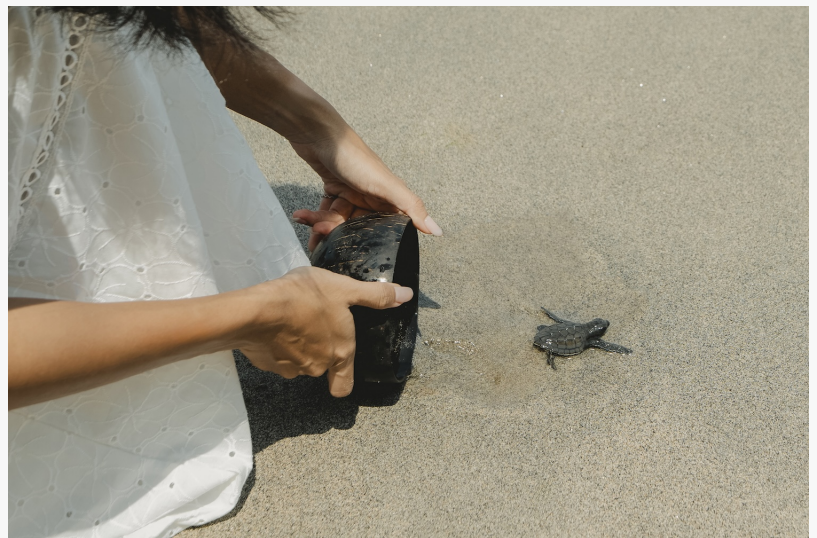
A sea turtle being released at The Sira