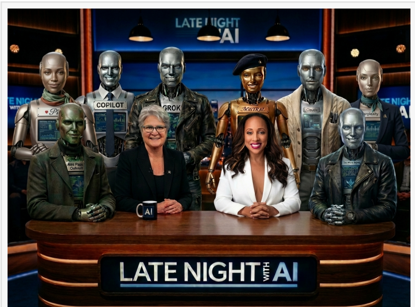
Late Night With AI Image #1

Structured as a late-night television experience with behind-the-scenes insight, Late Night With AI gives readers a fresh alternative to traditional AI literature. It avoids heavy jargon and instead