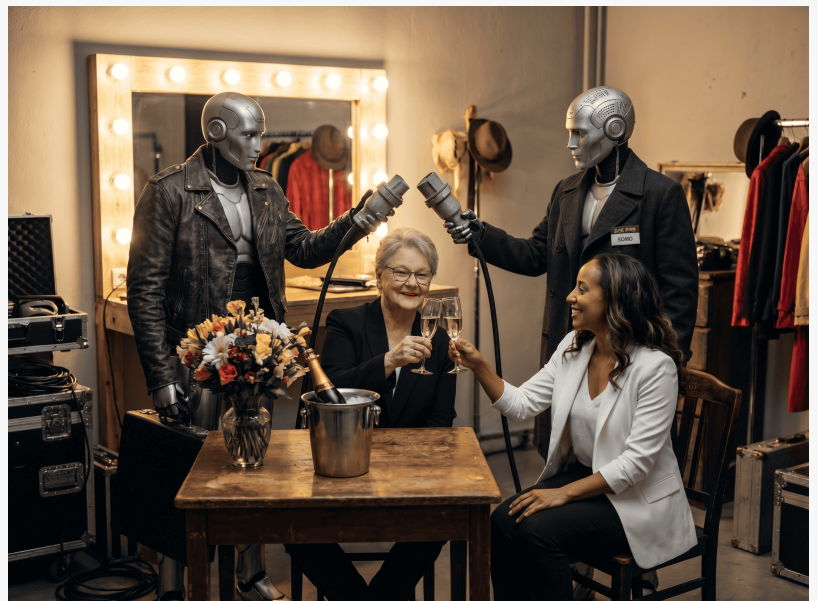
Late Night With AI Image #2