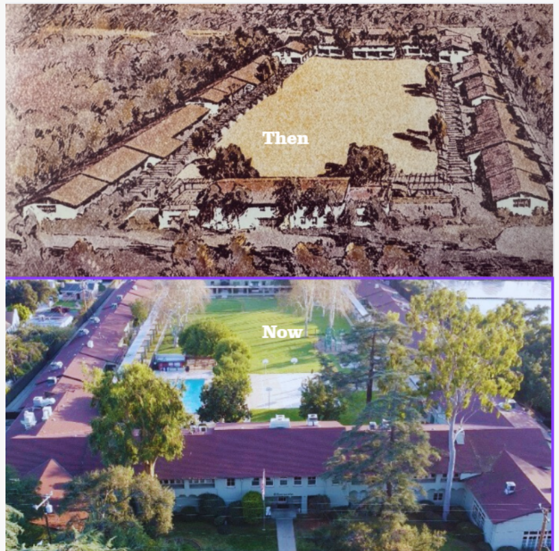
Five Acres Altadena Campus Then & Now

The Centennial Commemorative Ribbon Cutting Ceremony will feature a reception with live jazz music, welcome remarks, an official ribbon cutting, a commemorative centennial video, ceremonial toasts, and guided tours of the historic headquarters.