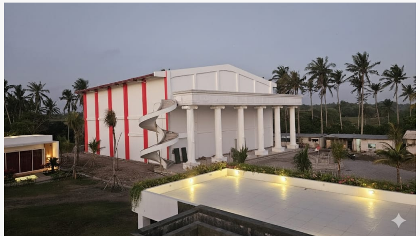
Largest Green Screen Soundstage in Indonesia