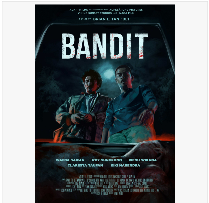
Bandit movie poster