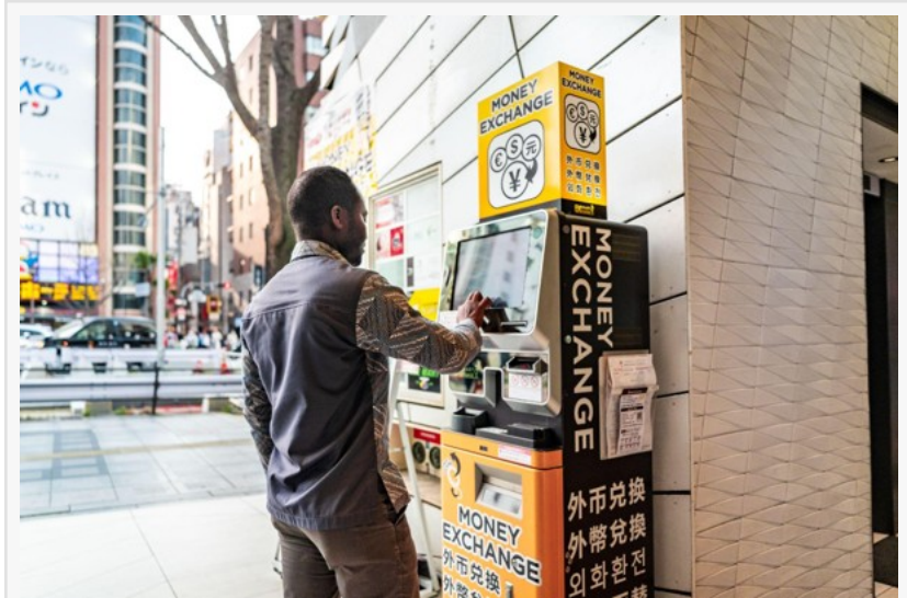
SMART EXCHANGE Tops 1,000 Unmanned Currency Exchange Machines in Japan, Surpassing 2 Million Annual Transactions