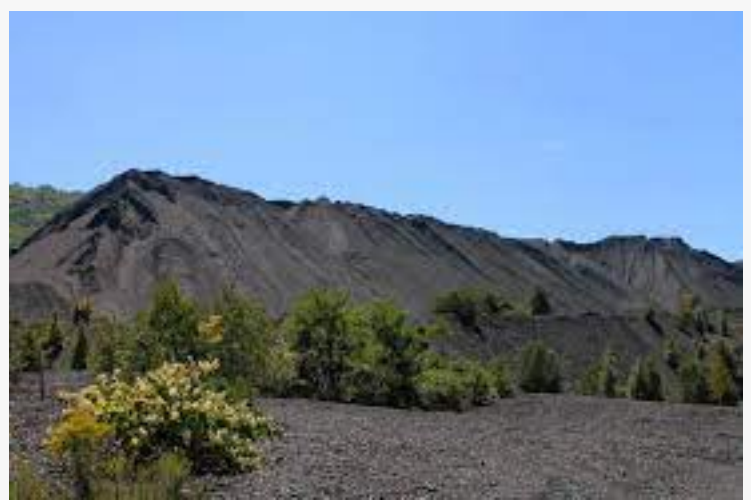
Waste Coal Piles containing rare earth elements