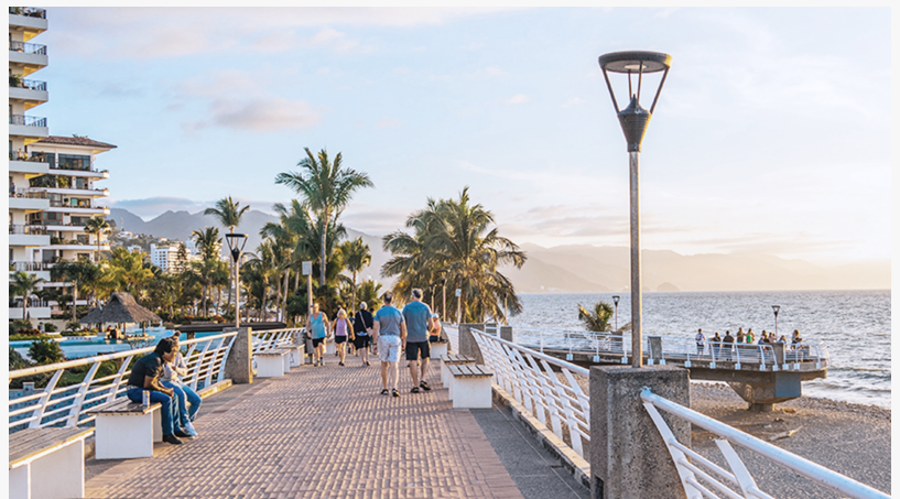
Off-peak season in Puerto Vallarta Mexico