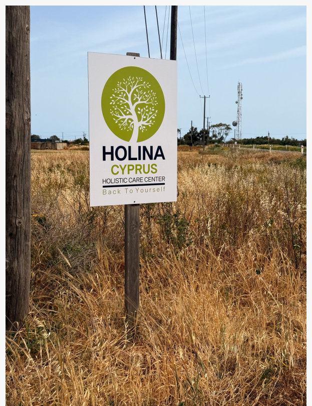
Welcome To Holina

The TC model treats recovery as a way of living — built through structure, peer accountability,