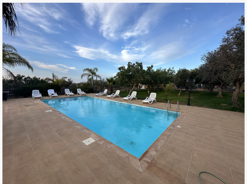
Relax By The Pool

and genuine community membership. At Holina Village, this is delivered within a working farm sanctuary: daily routines involving animal care, orchard work, and shared community life create the conditions for sustained change. Clinical therapies include CBT, DBT, ACT, motivational interviewing, trauma-focused somatic therapy, breathwork, equine-assisted therapy, art and music therapy, and non-religious 12-Step integration. Every resident receives a fully individualised treatment plan. Many members of the Holina team have personal recovery experience of their own — bringing lived understanding to every resident's journey alongside clinical training.