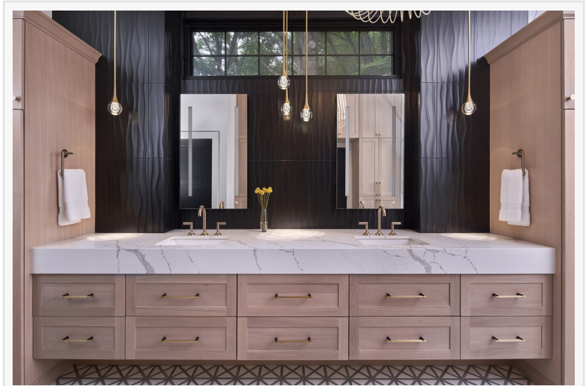
Striking textures and warm natural White Oak wood combine to create a deeply refined bathroom retreat.