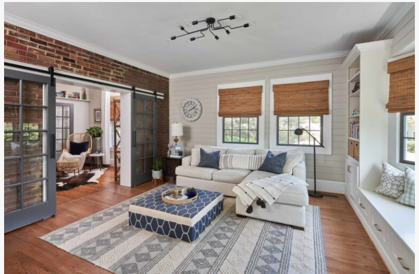
ReVision Design + Build's two-story historic home addition in Plaza Midwood, Charlotte, features a farmhouse-inspired aesthetic with shiplap walls and a neutral palette, seamlessly blending new construction with the original architecture.