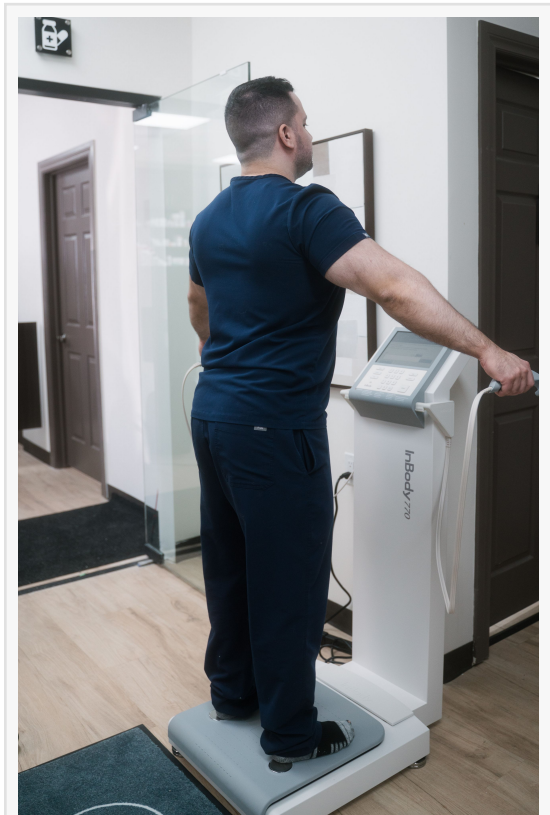
Body Composition Test in Kitchener-Waterloo

Body composition testing helps shift the focus from vague goals such as losing weight to more specific goals such as preserving muscle, reducing visceral fat, improving metabolic risk, and tracking measurable progress over time. For many people, the scale alone does not tell the full