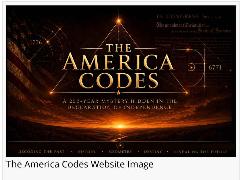
The America Codes Website Image