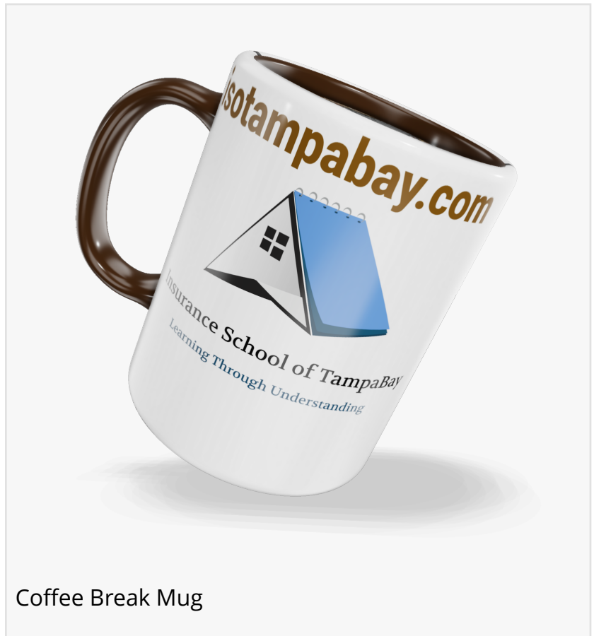
Coffee Break Mug