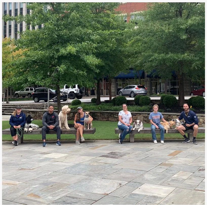
Trainers and dogs practicing calm public behavior, obedience, and focus together in a real-world outdoor setting.