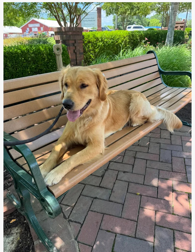
A calm Golden Retriever relaxing on a park bench while practicing patience, confidence, and better public manners outdoors.

Practical obedience skills can support safer handling before, during, and after seasonal events. Training programs offered by the Greenville location cover commands and behaviors such as come, sit and extended sit, down and extended down, place and extended place, heel, loose-leash walking, and off. Available board-and-train programs also address greeting manners, waiting at doors, meal manners, and responding around distractions in multiple environments.