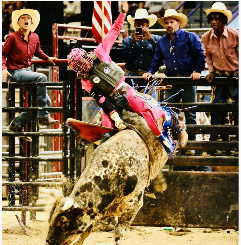
BPIR Bull Riding