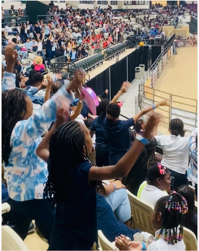
BPIR Foundation 2025 Rodeo for Kidz Sake, Prince George's County, Baltimore, and Washington, DC School Students