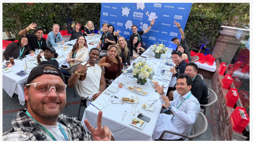
MOMO BOARD VIDCON 2026 - VIP DINNER

MOMO BOARD’s presence reinforced its premium position as a community super-app, a comprehensive platform which combines forum boards, group chat, and event creation with ticketing residing inside one community space that creators own, designed so that fans genuinely feel they belong. A trained architect, Shin espouses an ethos that MOMO BOARD should feel like a comfortable home for all, an authentic space for creators’ “1,000 true fans.”