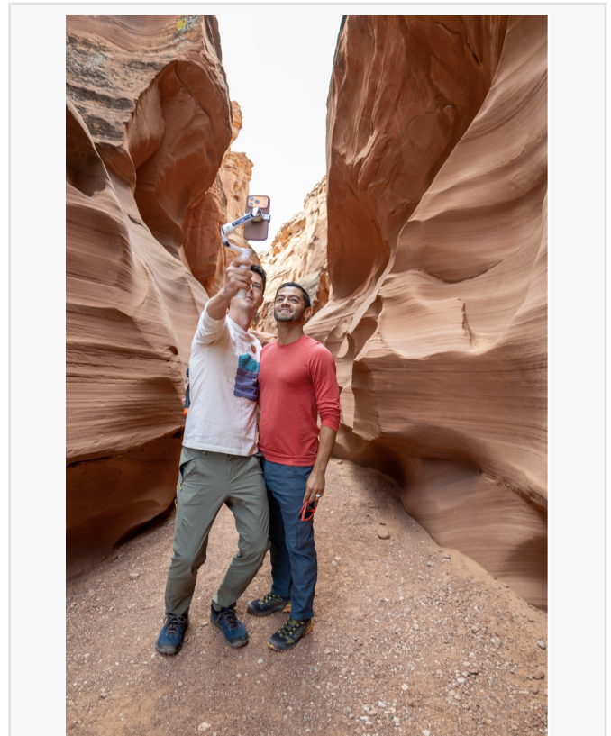
Antelope Air Trip

Antelope Air is a scenic air tour company based in Page, Arizona, offering professionally operated sightseeing flights over some of the American Southwest's most recognizable natural landmarks. Operating from Page Municipal Airport, the company provides aerial tours showcasing destinations including Lake Powell, Horseshoe Bend, Rainbow Bridge National Monument, Reflection Canyon, Monument Valley, Bryce Canyon, and surrounding canyon country. Antelope Air also offers combination tour experiences that pair scenic flights with guided ground excursions, providing visitors with multiple ways to