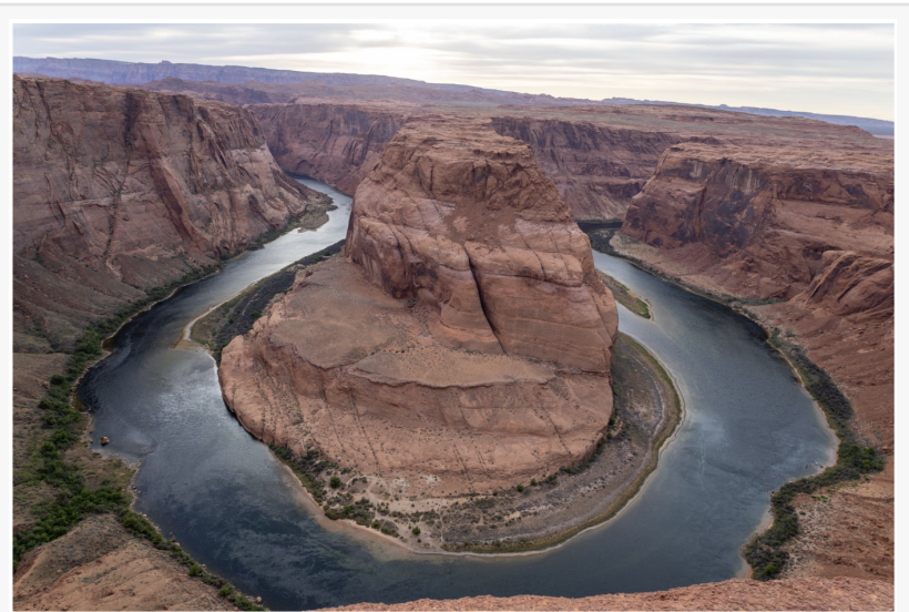
Horse shoe bend

One of the company's most popular experiences is its Lake Powell Air Tour , which provides passengers with expansive views of the lake's intricate shoreline, sandstone cliffs, secluded coves, and surrounding desert formations. From the air, visitors gain a greater appreciation for the immense size and complexity of one of the Southwest's most recognizable recreational destinations.