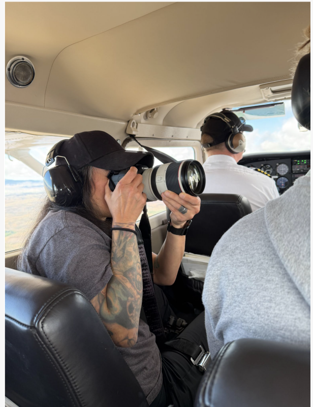
antelope air photographer

For many travelers, aerial sightseeing also complements a ground visit to Antelope Canyon. While guided walking tours allow visitors to experience the famous slot canyon up close, Antelope Canyon Flights present a dramatically different perspective by revealing the surrounding canyon systems, waterways, mesas, and geological features that cannot be seen from inside the canyon itself. Together, these experiences provide a more comprehensive understanding of the landscape that has made Page an internationally recognized travel destination.