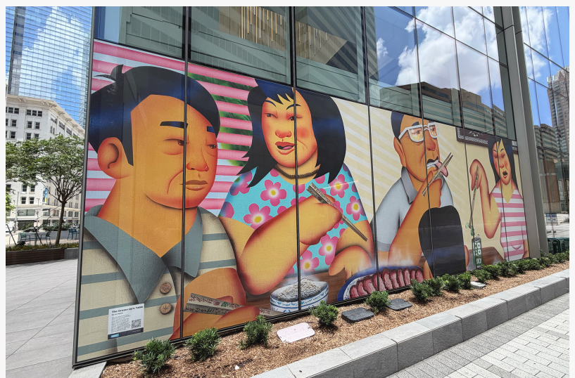
"The Grown Up's Table" by Houston artist Loc Huynh echoes "The Potato Eaters" by Vincent Van Gogh, depicting the quiet dignity and resilience of Vietnamese American culture.