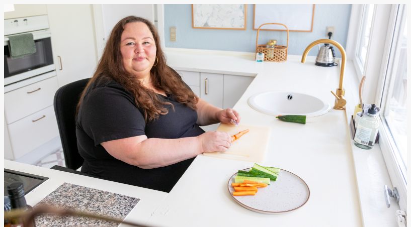
The hand-operated lock replaces the fear of a fall with the freedom to focus on making meals for the people you love with dignity.