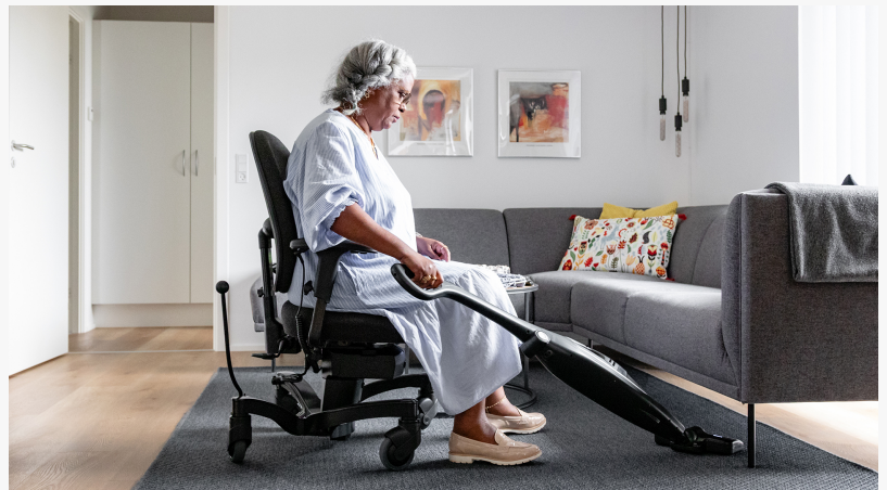
VELA Independence Chair with Power Wheels enables seniors to stay active and independent in their own homes.