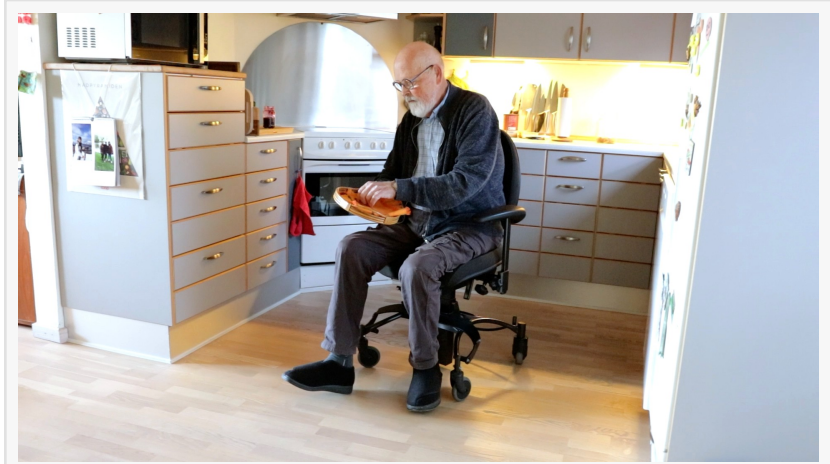
Move safely between the sink, fridge, and stove while seated, preserving your energy for the joy of cooking.

"Living with a chronic condition often means strictly budgeting your daily energy," says Johansen.