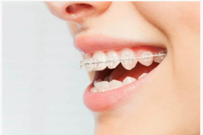
LA Holistic Orthodontics