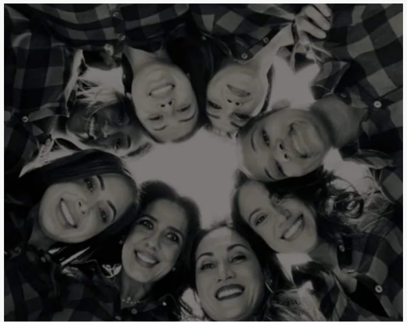
orthodontic care for children, teens, and adults

Orthodontic treatment has changed significantly with digital tools. Nikaeen Orthodontics uses digital scans, computer-guided planning, orthodontic simulation technology, and the iTero Digital Impression System to support diagnosis and treatment design.