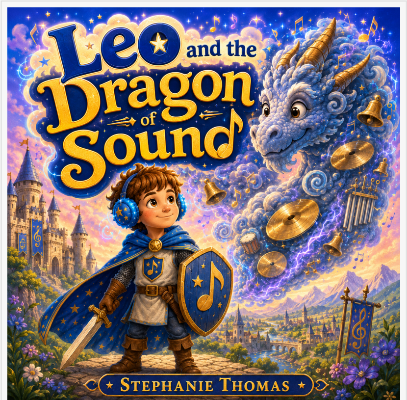
Cover of book Leo and the Dragon of Sound