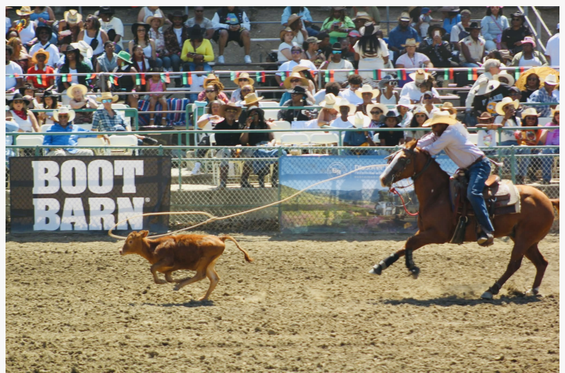
BPIR Oakland Rodeo in Castro Valley, CA

In addition to the excitement inside the arena, the Bill Pickett Invitational Rodeo Foundation continues its commitment to empowering the next generation through education and