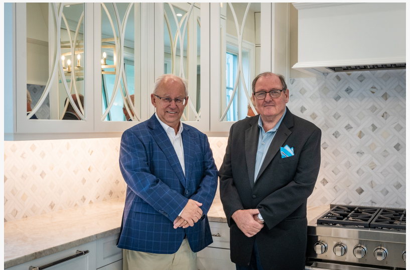
Luxury Realtors Vero Beach