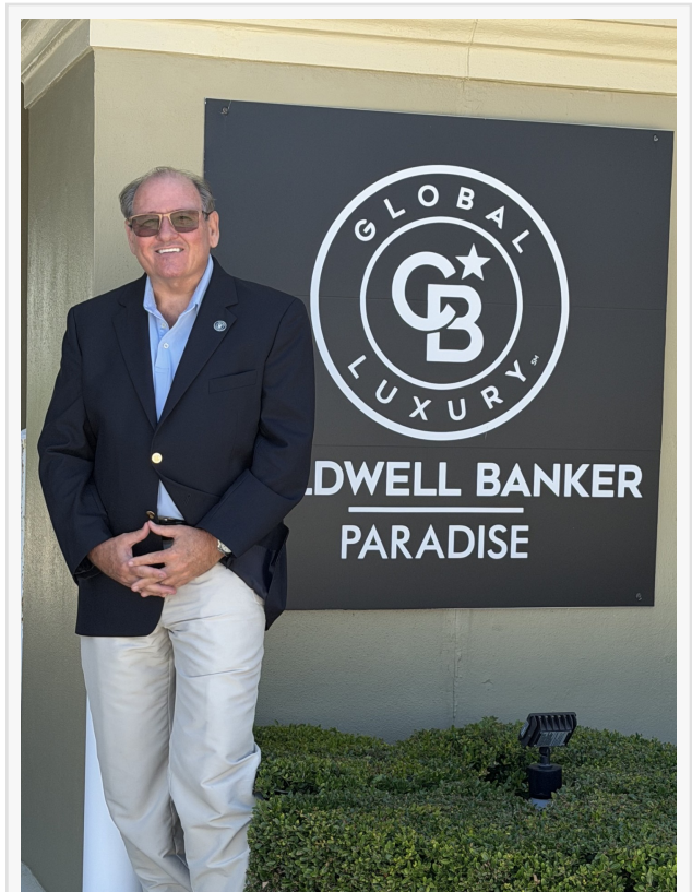
new office on the island