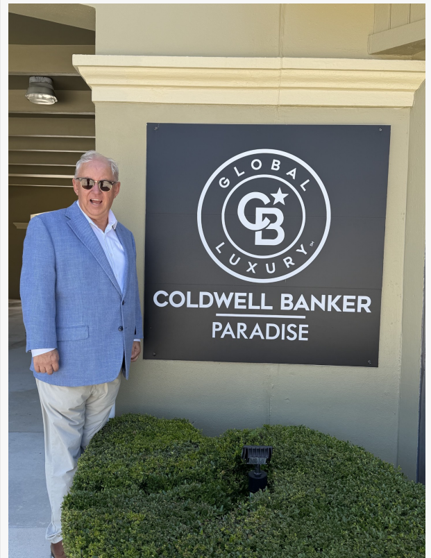
new office on A1A